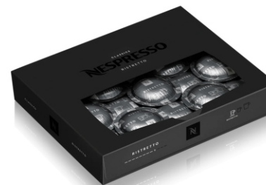
POS125 Nespresso pro coffee accessories 60 coffee capsules (50 regular - 10 decaf), 70 sugar sachets (30 white/30 brown/10 stevia), 15 milk portions, 60 paper cups and 60 wooden stirrers