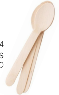
POS114 Wooden spoons Pack of 20