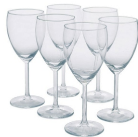
POS118 Wine glasses 150 ml, pack of 20 pcs