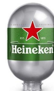
POS131 2 Beer kegs - 8lt each plus 50 disposable cups 400ml