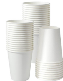
POS117 Refreshment paper cups 200ml / Pack of 250 pcs One wall / for water & beverages