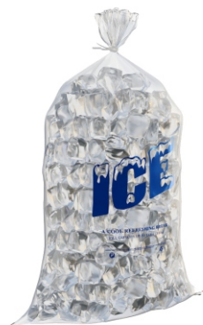
POS110 Ice cube bag 4kg / bag