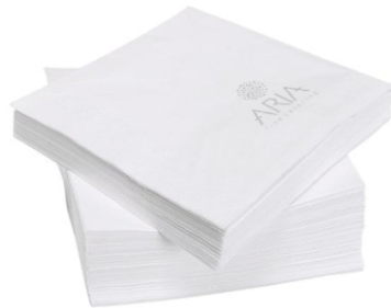
POS115 White napkins Pack of 50 pcs