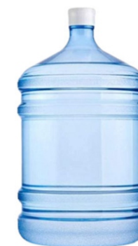
POS128 1 bottle of natural mineral water 18.9 lt, + 50 paper cups