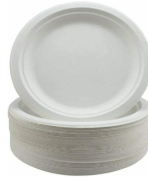
POS112 Biodegradable plates Pack of 20