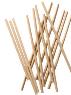
POS116 Bio straws Pack of 25 pcs