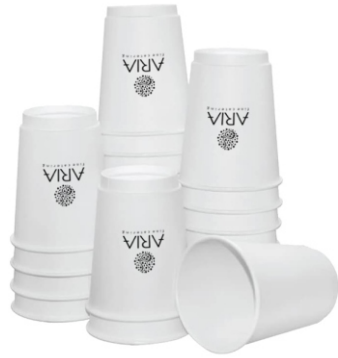
POS111 White paper cups Double wall / for hot beverages 250ml, 50 pcs