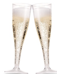
POS119 Champagne glasses 140 ml, pack of 20 pcs