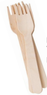
POS113 Wooden forks Pack of 20